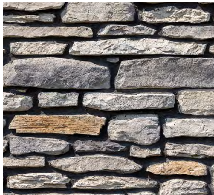
Mortar (Black) | Kentucky Gray LedgeStone