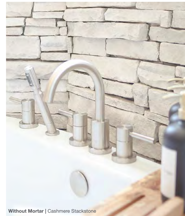
Without Mortar | Cashmere Stackstone