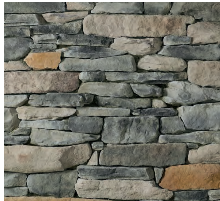
Without Mortar | Kentucky Gray LedgeStone