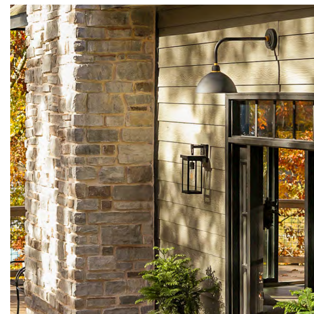
Mortar (Cream) | San Moritz Glen Ridge