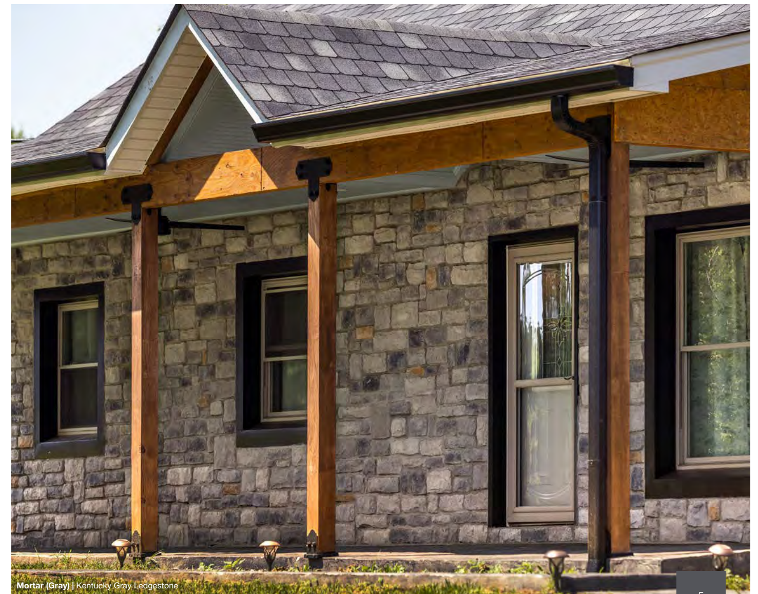
Mortar (Gray) | Kentucky Gray LedgeStone