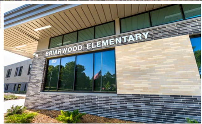
Two 3-way Norman size brick blends