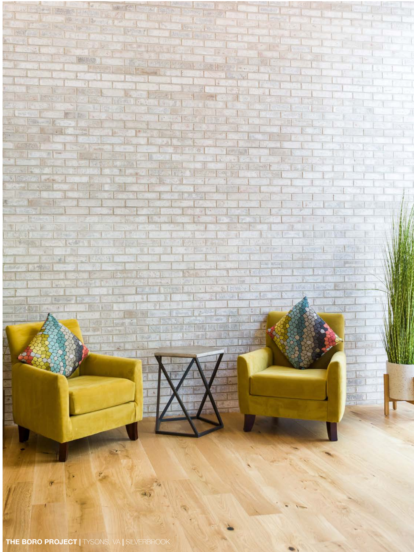
THE BORO PROJECT | TYSONS, VA | SILVERBROOK