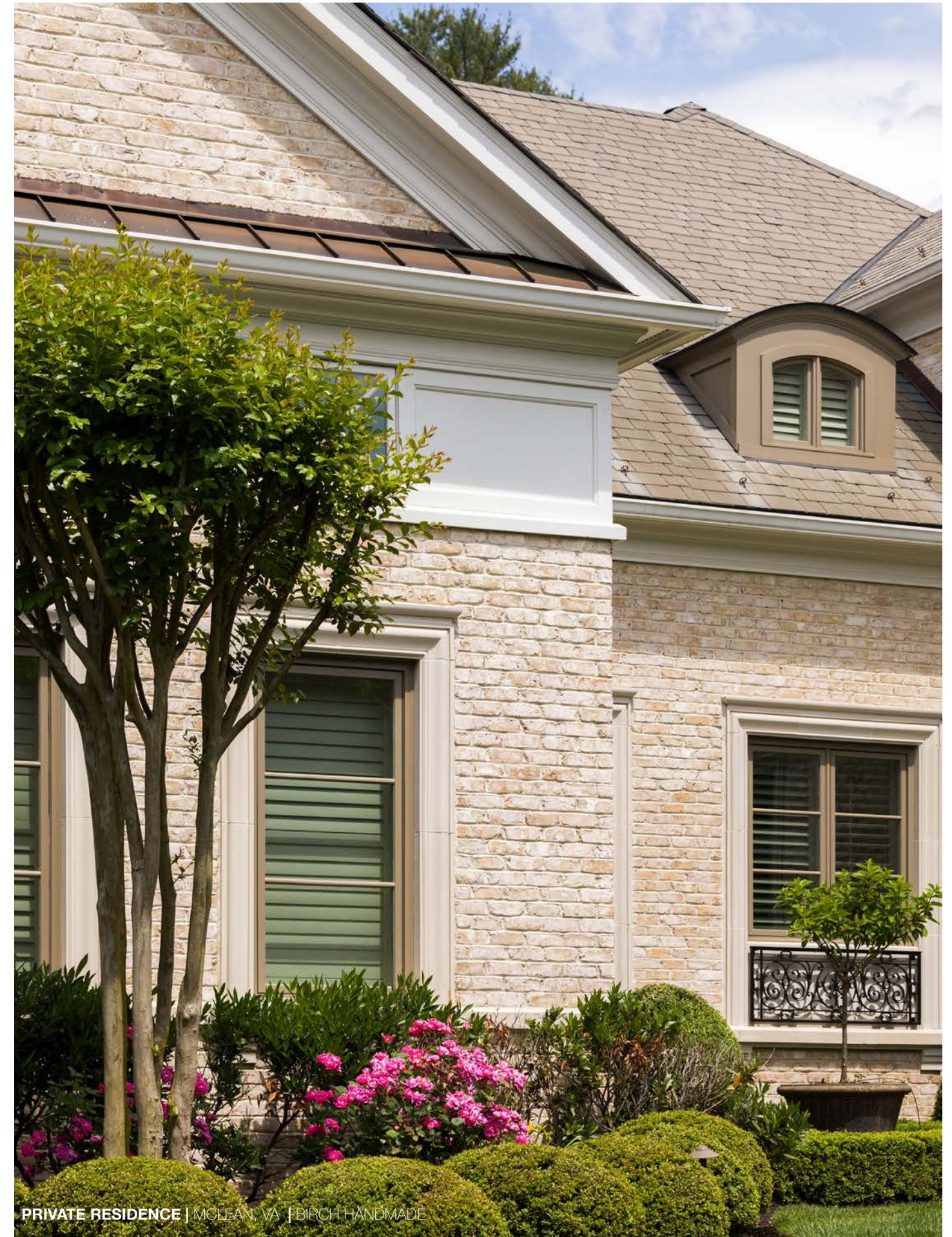
PRIVATE RESIDENCE | MCLEAN, VA | BIRCH HANDMADE

Glen-Gery Corporation, part of Brickworks Limited of Australia, is a premier brick and stone manufacturer offering the most diverse product portfolio of more than 700 brick and stone products. For more than a century, Glen-Gery has provided high quality building products that meet both innovative design challenges and demanding construction specifications. Through technology advancements and product innovations, Glen-Gery delivers a premium product line that caters to the high-style needs of today's architects, designers and homeowners. Founded in 1890, Glen-Gery is headquartered in Wyomissing, PA.