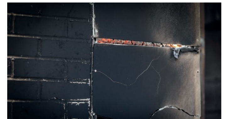
Bricks are non-combustible unlike other materials.