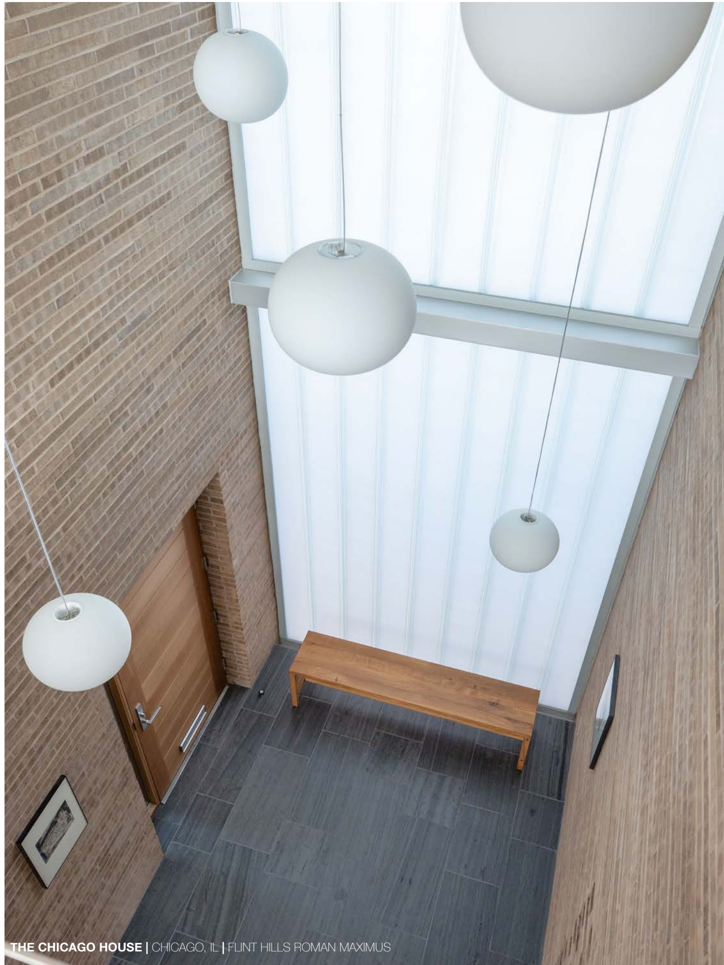
THE CHICAGO HOUSE | CHICAGO, IL | FLINT HILLS ROMAN MAXIMUS