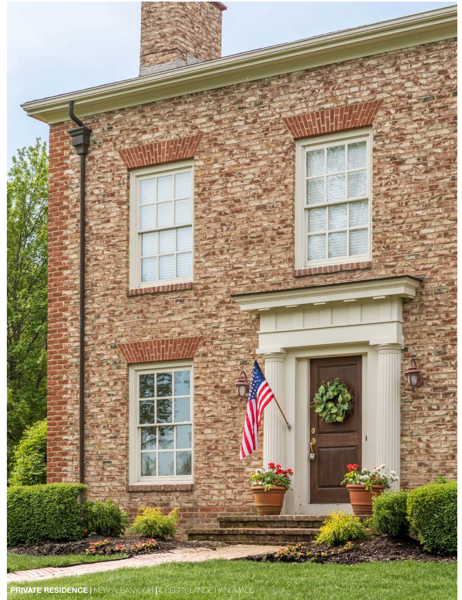
PRIVATE RESIDENCE | NEW ALBANY, OH | CHERRY LANDE HANDMADE