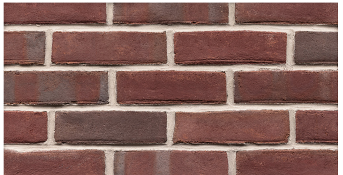
Royal Plum Full Range